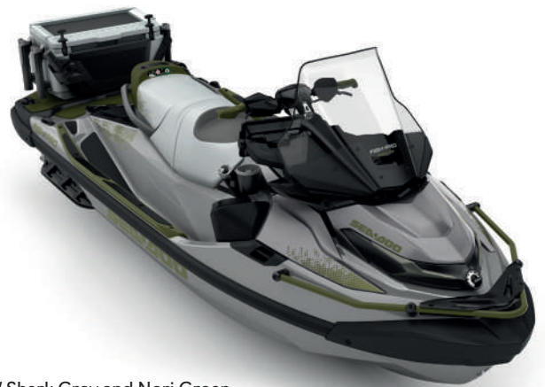
NEW Shark Grey and Nori Green