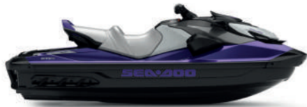
● NEW Midnight Purple