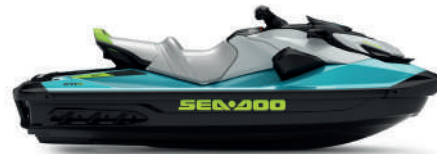
● Teal Blue and Manta Green