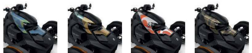
Urban Blue Atlantis Gold Cyber Orange Moka Plaid