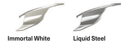
Immortal White Liquid Steel