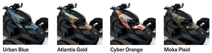
Urban Blue Atlantis Gold Cyber Orange Moka Plaid