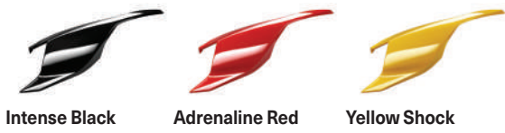
Intense Black Adrenaline Red Yellow Shock