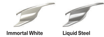
Immortal White Liquid Steel