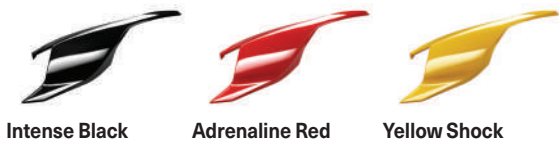
Intense Black Adrenaline Red Yellow Shock