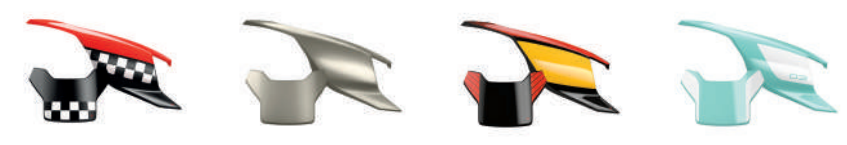
Racer Red Liquid Titanium Heritage Yellow Mint Freeze