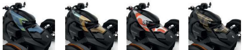
Urban Blue Atlantis Gold Cyber Orange Moka Plaid