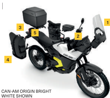
CAN-AM ORIGIN BRIGHT WHITE SHOWN

Premium package with exclusive coloration, trims and additional features such as a LinQ Windshield for added comfort and Signature LED lights.