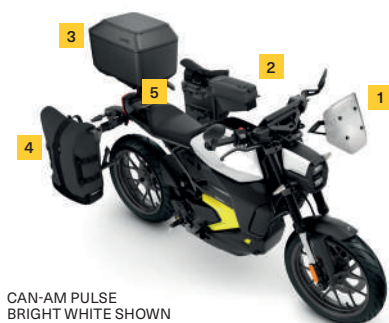
CAN-AM PULSE BRIGHT WHITE SHOWN