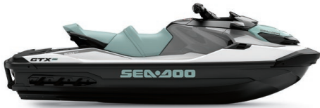
White and Neo Mint